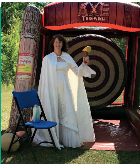
Summer Reading Club Kick-Off Party