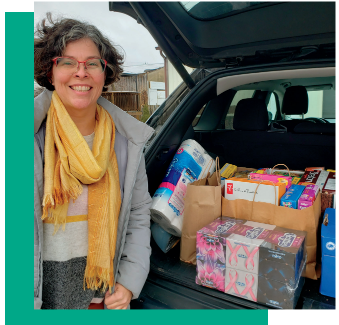
Food for Fines

BCPL worked throughout 2022, diversifying our collection. By identifying titles that fall under the eight selected Diversity, Equity and Inclusion (DEI) topics, we were able to bring in relevant, interesting and informative materials to all our Bruce County patrons. This will aid in an overall goal of inclusion as well as helping those who identify outside of these topics experience views and realities they may not have the opportunity to in their day to day life.